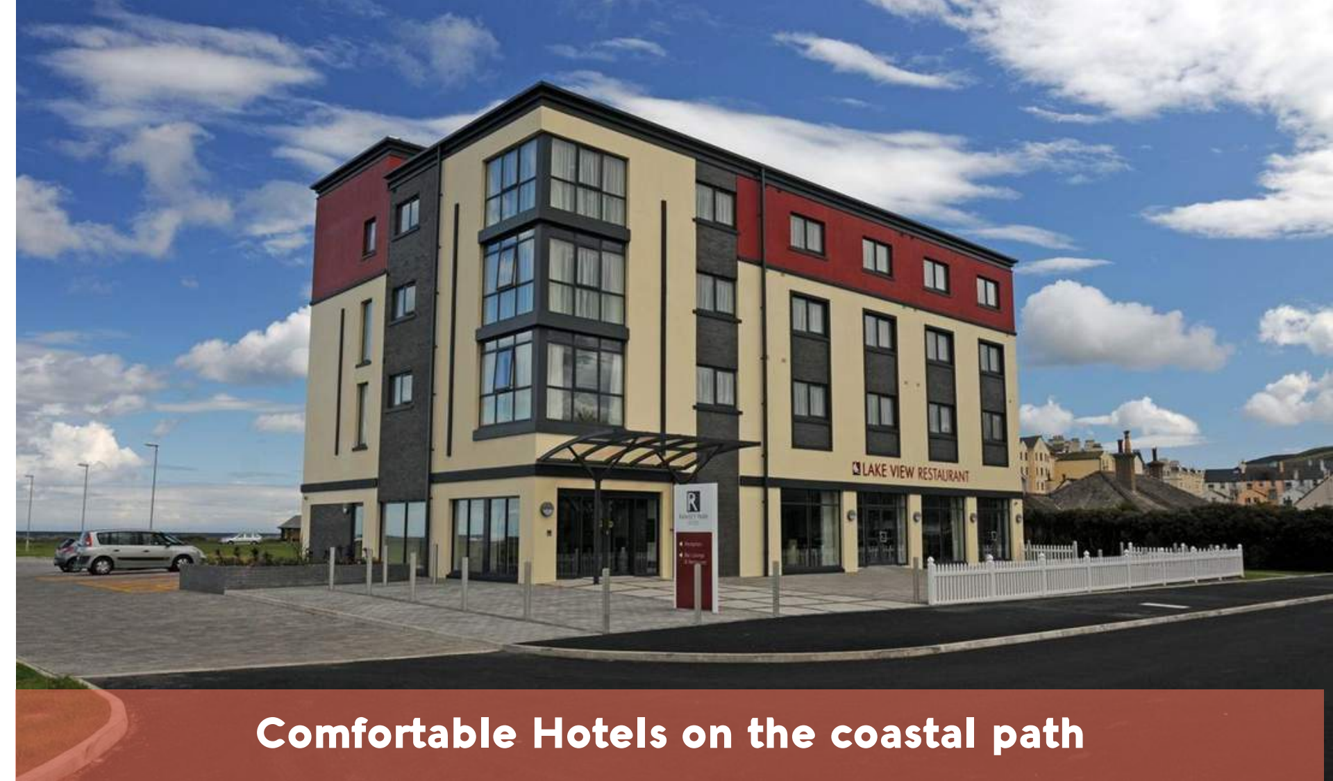
Comfortable Hotels on the coastal path