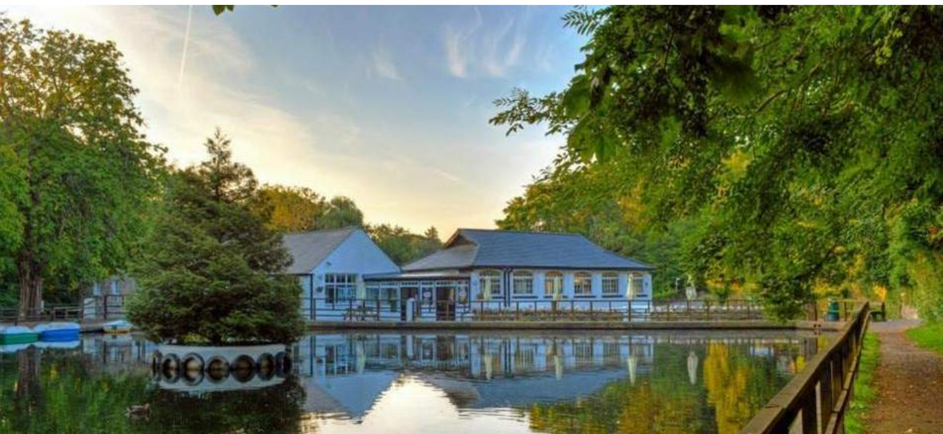
Hostel and bunkhouse accomodation in picturesque places