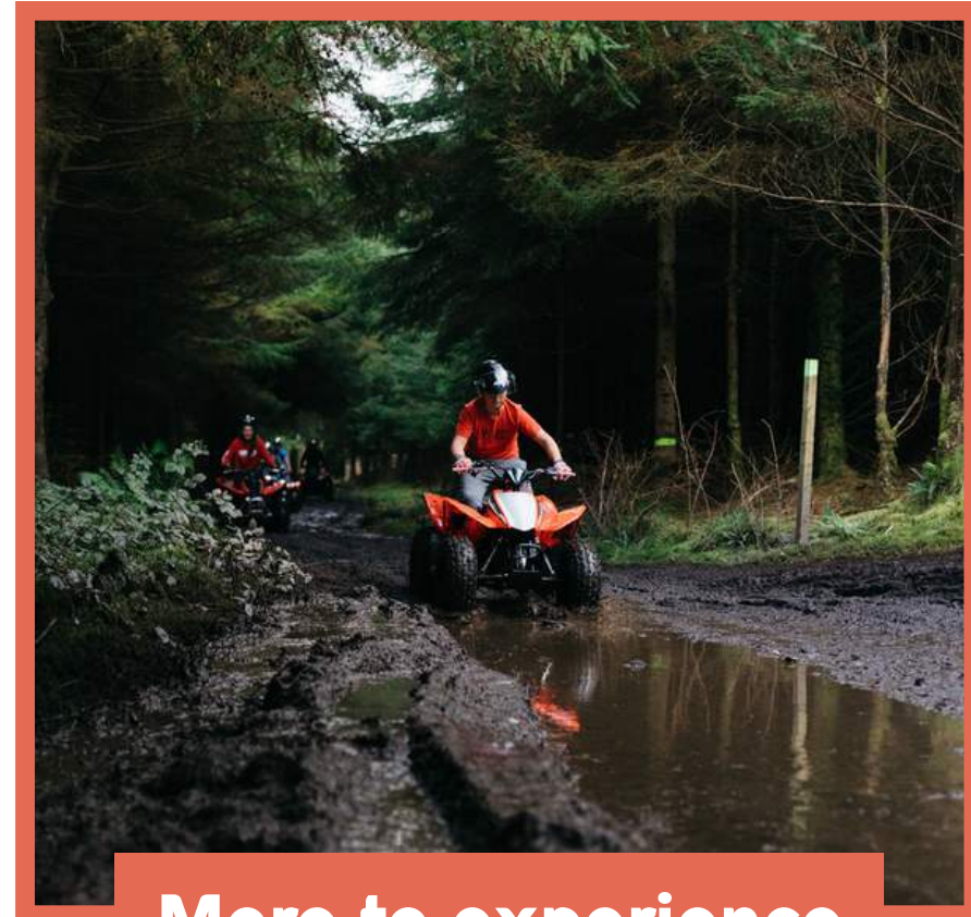
More to experience

Catering for absolute beginners through to those with more experience, the Isle of Man provides a stunning backdrop to test strength in a variety of indoor and outdoor climbing adventures.