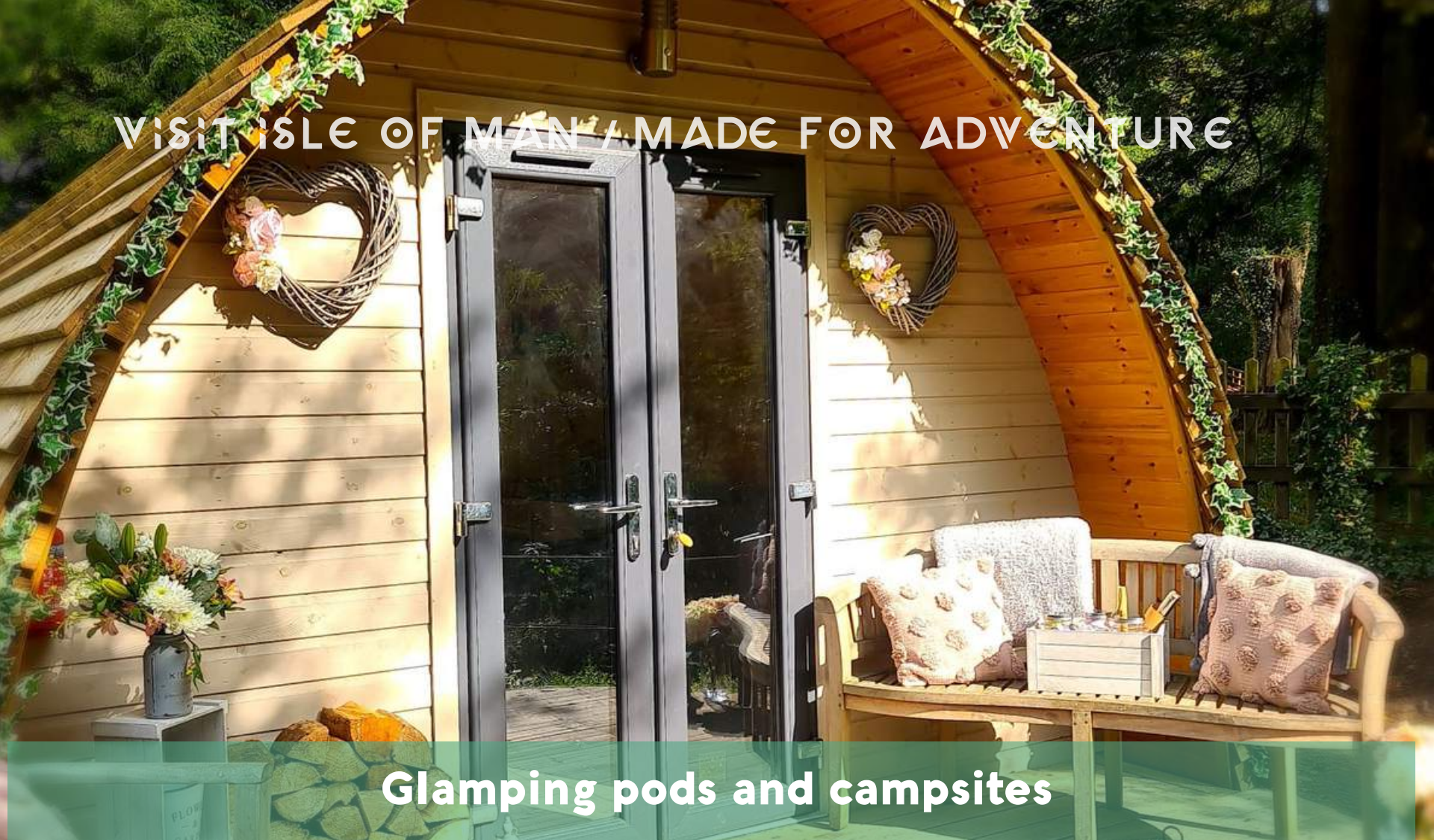
Glamping pods and campsites