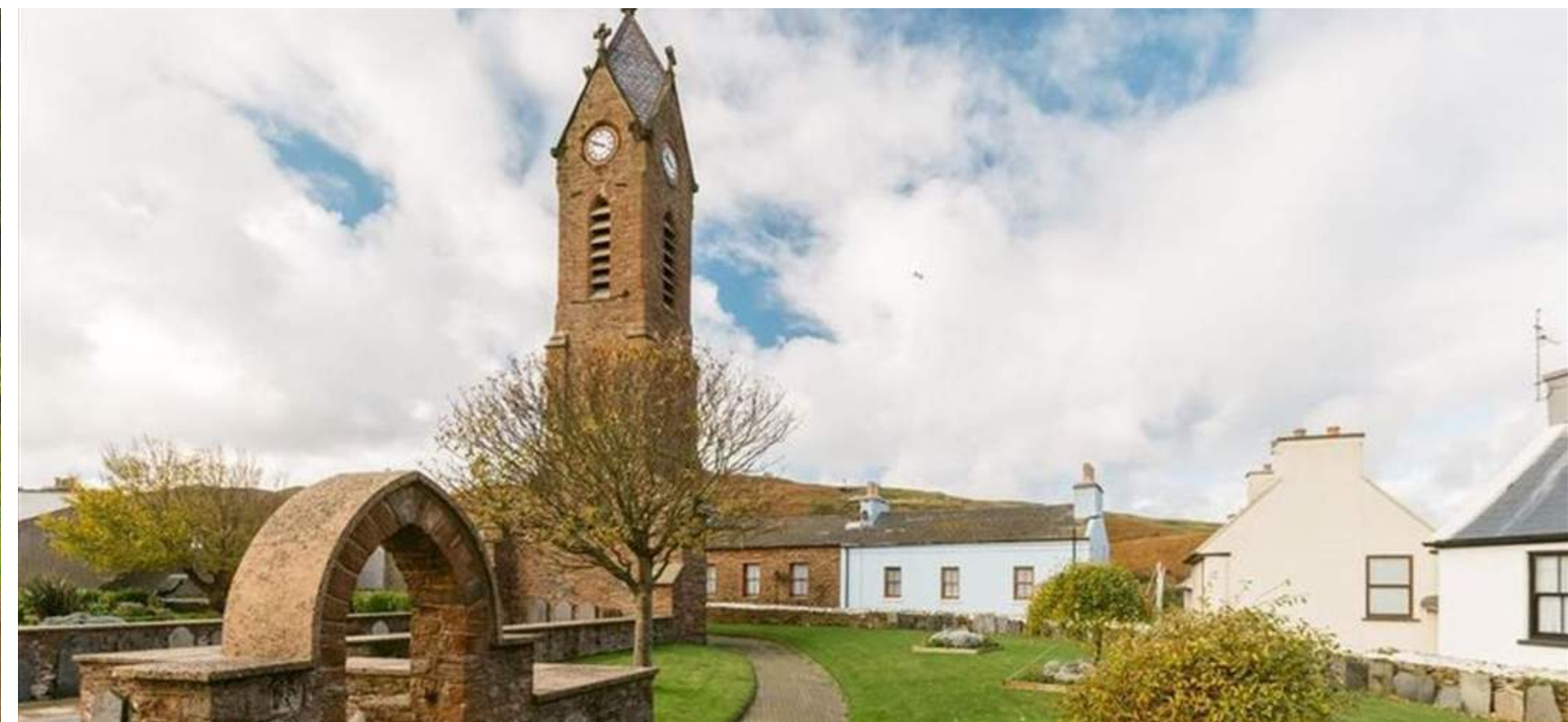
Idyllic and traditonal Self Catering base